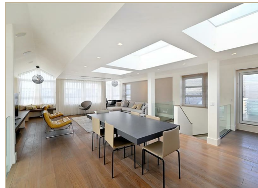
Kensington Gardens Square Approx. Gross Internal Area 1503 Sq Ft - 139.63 Sq M